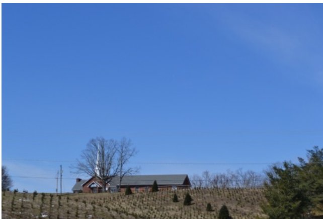
Fig. 25. Laurel Fork Church From Aho Gap.