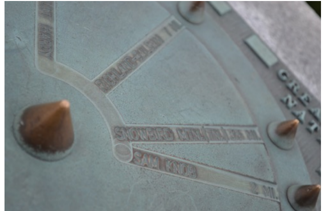
Fig. 15. Sight cone plaque.