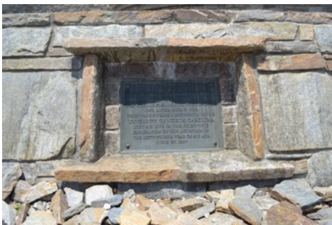
Fig. 7. Another view of Mitchell’s tomb.