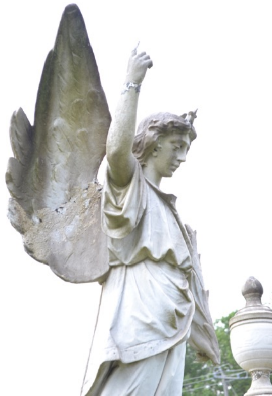
Fig. 2. The Wolfe Angel, Oakdale Cemetery, Hendersonville, North Carolina