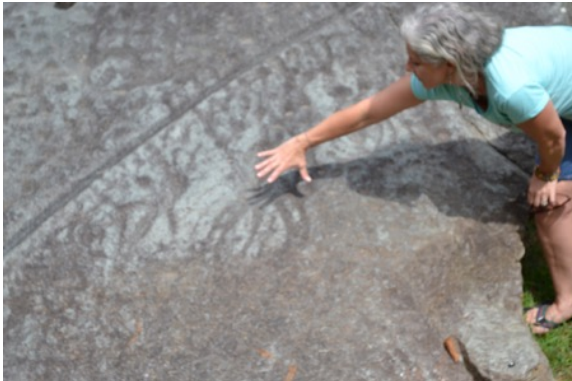
Fig. 18. Judaculla's handprint.