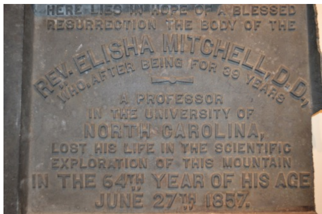
Fig. 8. Graver marker on Mitchell's tomb.