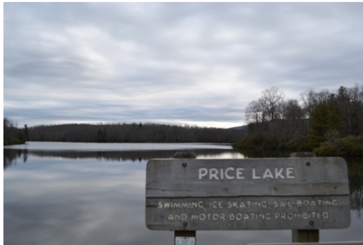
Fig. 33. View of Price lake from the Parkway pull-off.

In four different poems in three books, Rash alludes to a historical tragedy from January 1863, the Shelton Massacre. After a bad winter in the divided counties of Madison and Yancey, the North Carolina 164th Division executed fifteen Yancey County men between the ages of twelve and fifty-nine for raiding their homes for rationed goods, particularly salt. Rash commented about why this event has haunted him enough to show up in his poetry and in his novel The World Made Straight : "After a visit to Shelton Laurel in the spring of 2003, I finally began a story that dealt not only with the massacre but also with its continuing importance over a century later to the participants' descendants." The tension during the Civil War was high in the mountains because the mountains split—even counties split—to serve either the north or the south. This truly was a borderlands at that time, and people were caught on both sides fighting against neighbors and kin. Rash was bothered by the fact that the youngest of the executed was killed last, even after begging to be released to his mother.