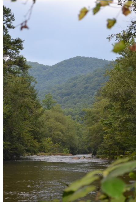
Fig. 3 and 4. Green River Cove Road (left) and the Green River (right) near Henderson, North Carolina.

I did realize the proximity between my three poets and how their relative closeness reinforces the theory that place is important to the formation of poetry. The place of the southern Appalachians is distinct, and the poetry coming out of there is distinct. Place influences the poetry and marks each text with a fingerprint. You can read any of these three writers and know that they came from the southern Appalachians because of the place references, the voices, and the stories. Being able to see these places, firsthand, gave me another facet of knowledge about the place and the poetry.