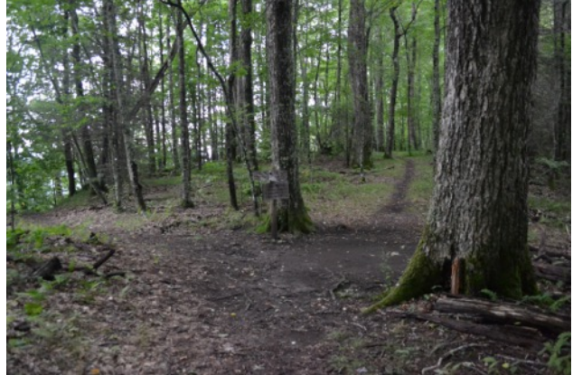
Fig. 23. Conjunction of Kanati Fork and Thomas Divide, GSMNP.