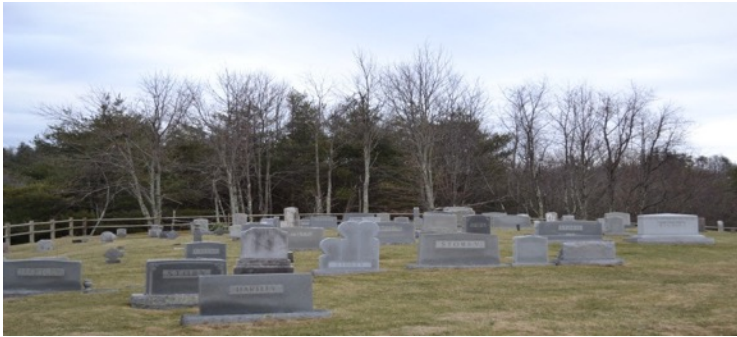
Fig. 27. Laurel fork Cemetery as seen from the church door.

disappears. He is concerned with history and heritage and the importance of family ties, the land, and the battle between good and evil that occurs in the human