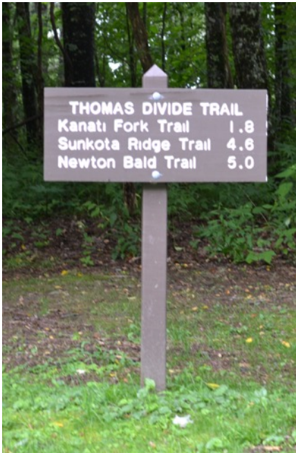
Fig. 20. Trail marker for Thomas Divide Trail, GSMNP.