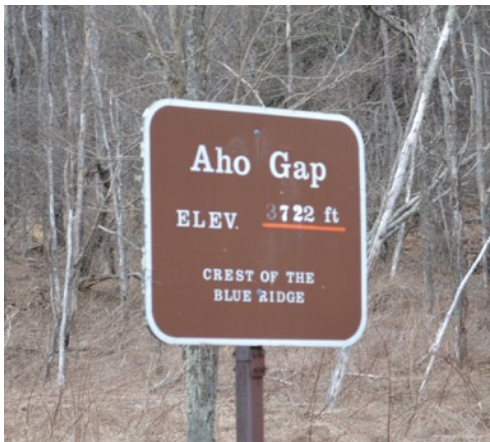
Fig. 30. Sign for Aho Gap on the Blue Ridge Parkway.