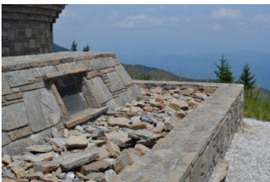
Fig. 7. Another view of Mitchell’s tomb.