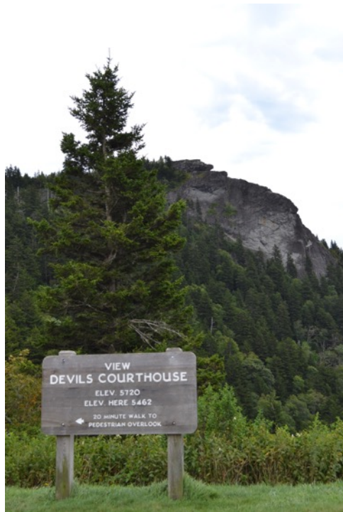
Fig. 10. Profile of Devil’s Courthouse