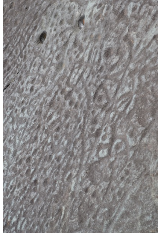
Fig. 17. Close-up of Judaculla Rock