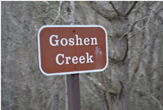
Fig. 31. Goshen Creek sign Bamboo Road, Boone, NC.