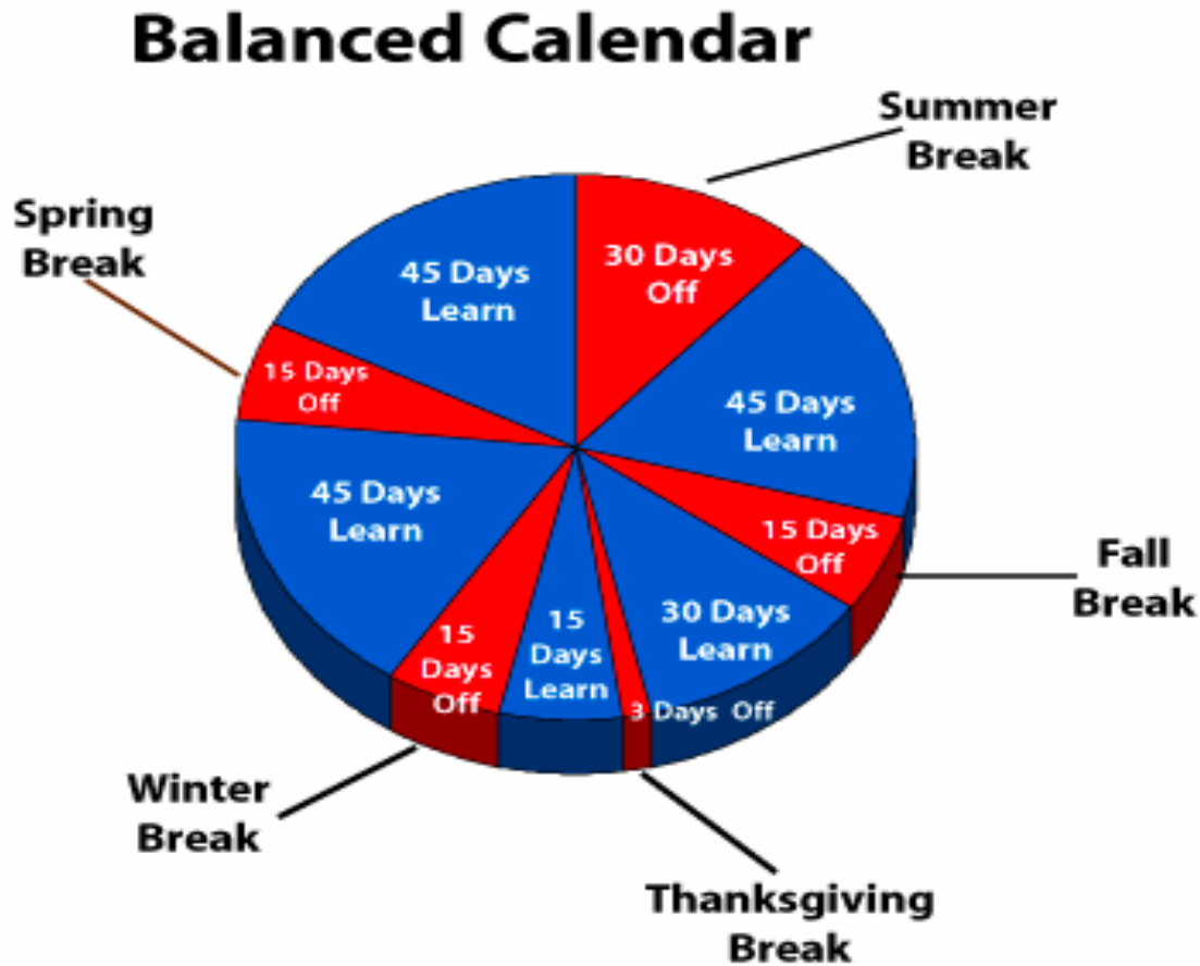
Figure 2. Balanced single-track calendar.

The single-track calendar reduces the long summer break and simply apportions those days throughout the school year, producing more frequent breaks and limiting long periods of in-session days as well as long periods of out-session days (NAYRE, 2008).