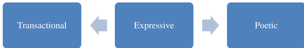
Figure 1. Britton’s (1978) three principal categories of writing functions.

from expressive to poetic includes “language in the role of spectator” (Britton, 1978, p. 27). Britton’s theory, on the one hand, clarifies the connection from expressive to transactional discourse and from expressive to poetic discourse with the sense of audience and context in the composing process, but does not address the relationship between poetic and transactional discourses at all, on the other.