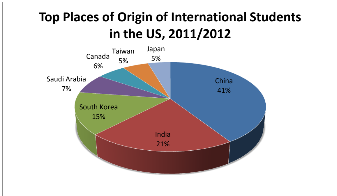
Figure 1. Top Places of Origin of International Students in the U.S., 2011/2012.

The vast majority of these international students enroll in BA-level programs in the US. The number of those enrolled in MA level programs in 2011/2012 almost equals the latter (n.d., 2011c). Interestingly, the number of students in a U.S. IEI (Intensive English programs) also increased from 29,603 in 2010/2011 to 35,108 in 2011/2012. Based on this data, the age and academic background diversity of prospective EAP students in the US continues to vary significantly: more adults with higher degrees are enrolling in EAP programs today, than just a year ago, while overall there has been a stable increase in the number of international students in the U.S. since 2004. Since the largest population of international students represented in EAP programs today, including the focal study site, come from East Asia and Saudi Arabia, the educational landscapes of these students will be explored in-depth in this particular section (n.d., 2011c).