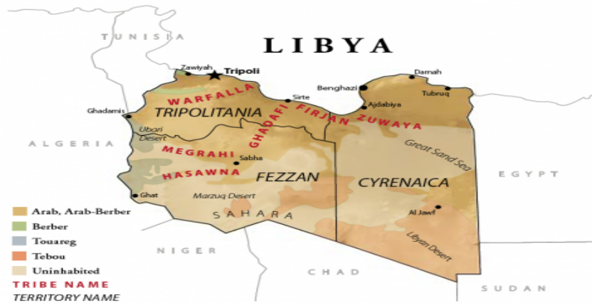
Figure 1. Map of Libya Shows the Three Provinces.

When the Ottoman Empire lost their power in the 18 th century, it eased the Italian colony to the country. According to Vandewalle (2012), the Italian government considered the Libyan coastal cities as the Italian fourth shore, and they aimed to unify the Libyan coastal cities under the government of Italy.