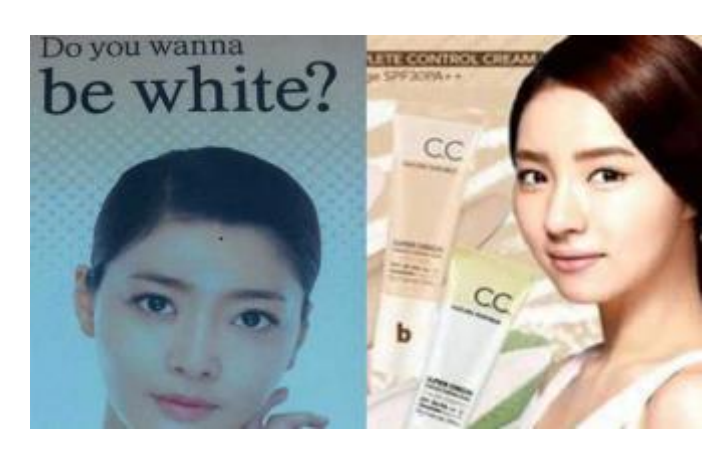
Figure 6. Skin whitening cream advertisements in South Korea.

working as a BTE in South Korea, was that because of my awareness of how blackness was interpreted by my students and the rampant skin whitening product promotions through South Korea mediascapes (See Figure 6), I felt obliged to carry out lessons focused on the beauty of blackness and contributions of Blacks in society.