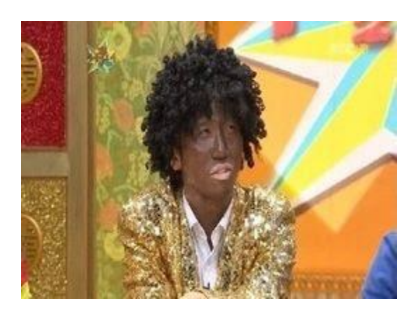
Figure 1. South Korean comedian, Lee Bong-won, wears blackface on T.V.

Korean woman or perhaps perceived to be an official beauty standard within South Korea. Tate (2007) argued that there is global beauty standard that "[...] is a reflection of the dominant beauty paradigm which privileges white/light skin, straight hair and what are seen to be European facial features" (p. 301). My intuition told me that because I was non-Korean and working in a non-menial position, students' judgment of me were primarily based on superficial appearances and ideologies within their own cultural society rather than mine. Within my cultural upbringing, wearing one's hair natural, or in an afro-textured state, is a sign of self-love, consciousness, and a representation of combating European beauty standards of straightened hair that has flourished within Black cultures (Tate, 2007). Seemingly, students were not accustomed to seeing an afro being worn, especially on a darker-skinned person, unless it was for comedic purposes. Wearing blackface and an afro is considered entertaining and can still be watched on South Korea's SBS and MBC television (Matt, 2012) (See Figure 1).